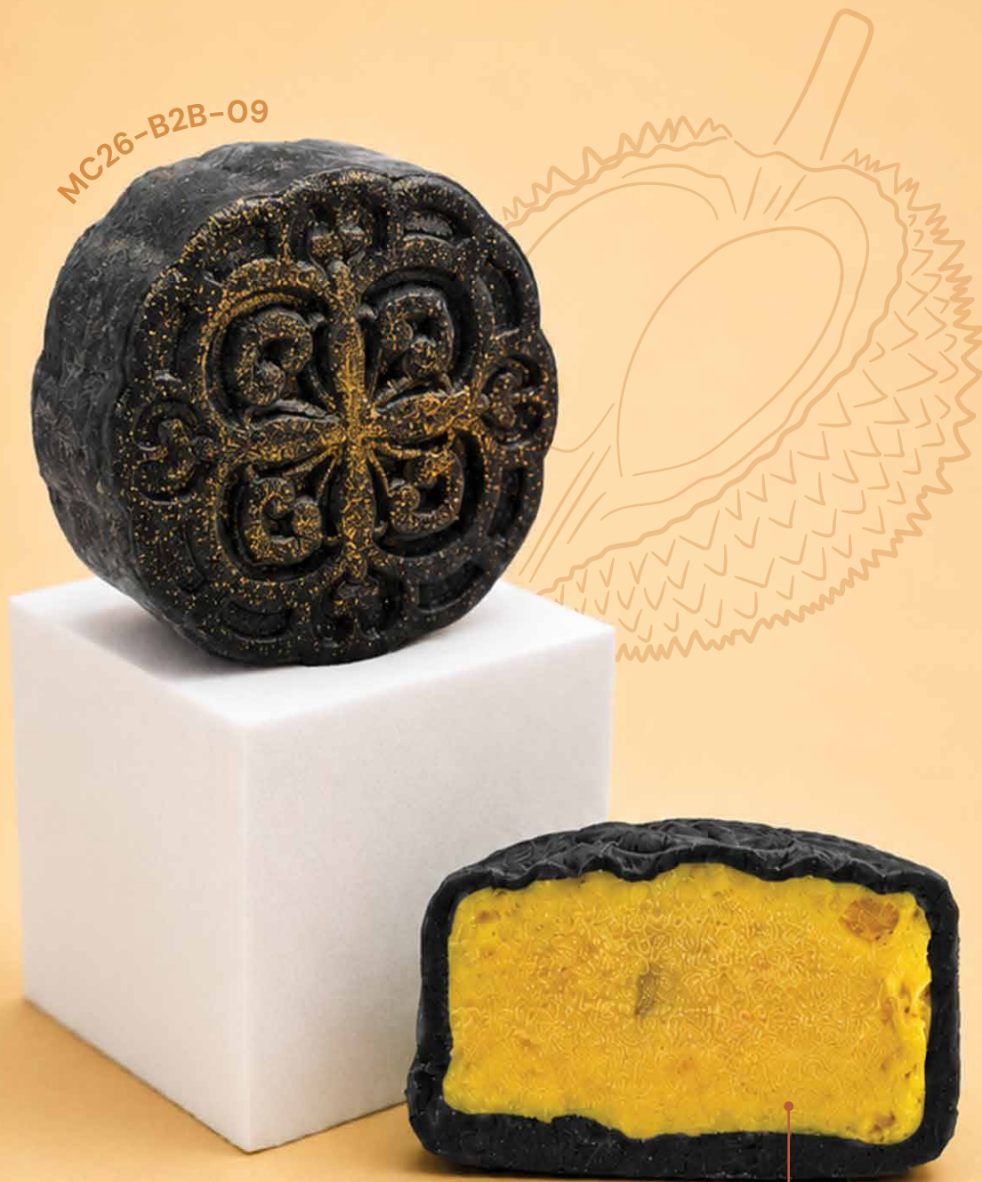
Bites of Durian Pulp